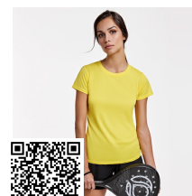
MONTECARLO WOMAN CA0423