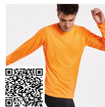
MONTECARLO L/S CA0415